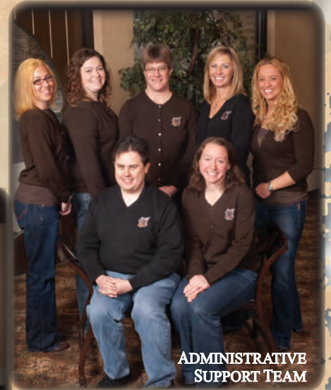
ADMINISTRATIVE SUPPORT TEAM